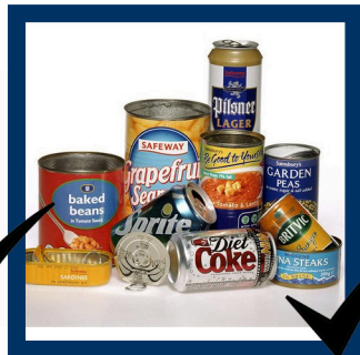
Cans & Tins