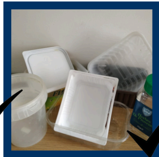
Plastic Pots, Tubs & Trays